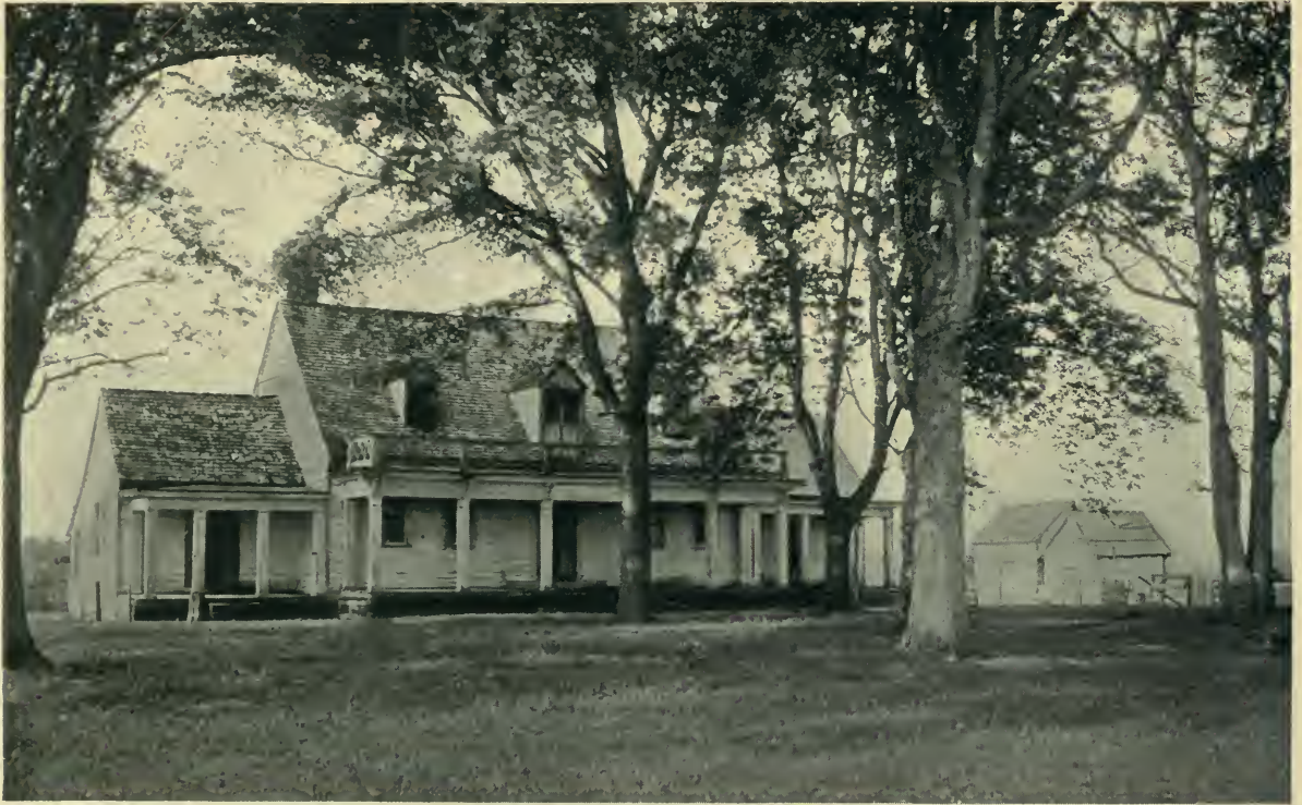
"THE GLIBE," POWHATAN COURT, VIRGINIA

An example of the use of a large central dormer with smaller ones on either side; characteristic of houses of this class in the South